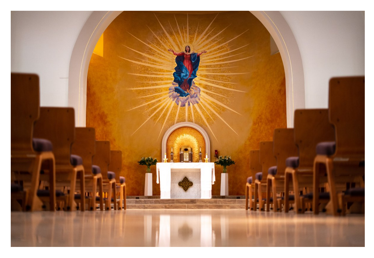
Figure 4: Portrayal of the Assumption of Mary into Heaven in Assumption Chapel at St. Mary's University.

past. It does not merely connote reward for a life well lived, but an ongoing position of authority, even if subordinate to an implied male counterpart, the king. Christians today can find theological insight more relevant than the cultural assumptions and metaphors of the past. Christians differ in our experiences of how and with whom we can relate. Some find it easier to relate to a woman, even if the ultimate goal is to relate better to her son. Catholicism expresses this idea through the idea of patron saints of nationalities and professions (see Theological Questions "Citizenship in the Roman Empire and Medieval Europe"). The controversy is only partly whether it can be helpful to relate to people besides God as a means to relating to God.