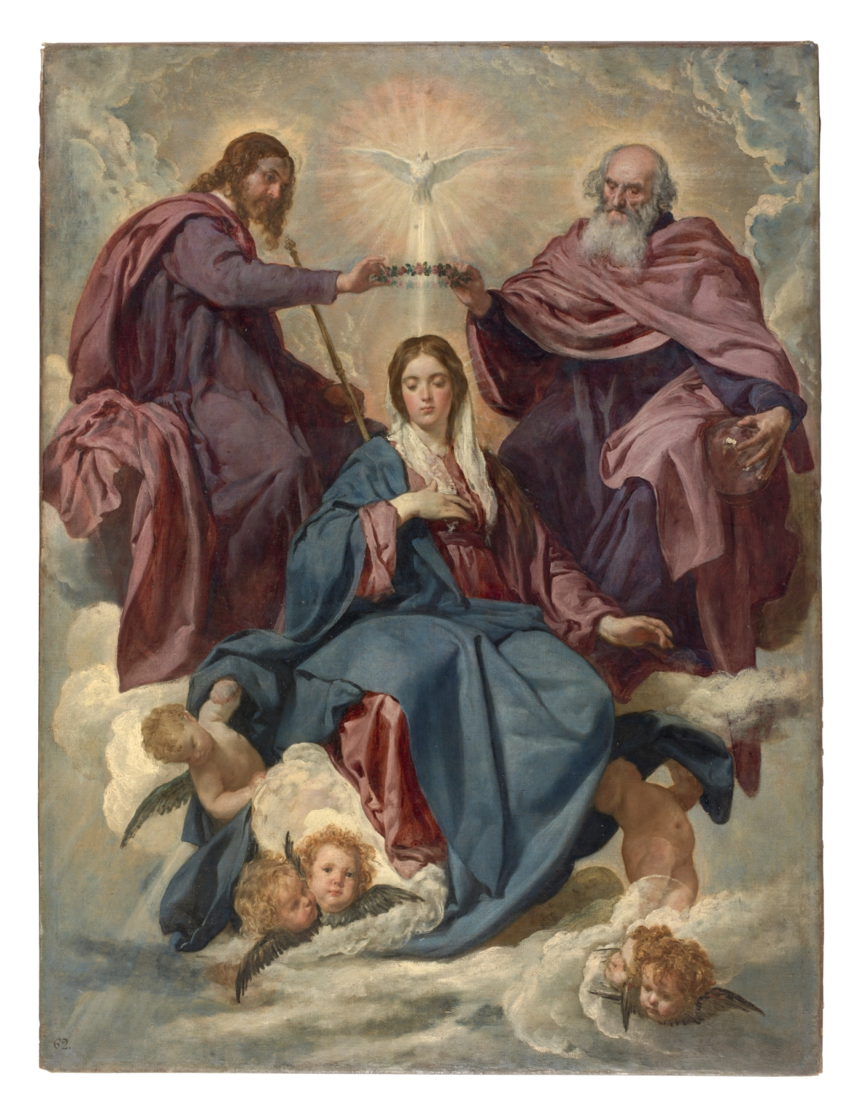
Figure 5: The Coronation of the Virgin painted by Diego Rodríguez de Silva y Velázquez, 1636, Museo del Prado.